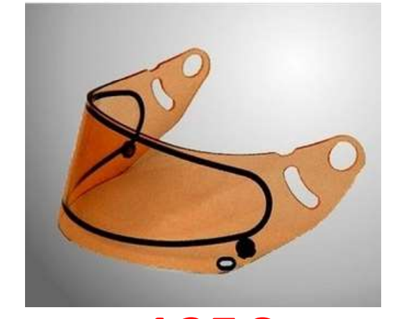
ANTI FOG DUAL PANE