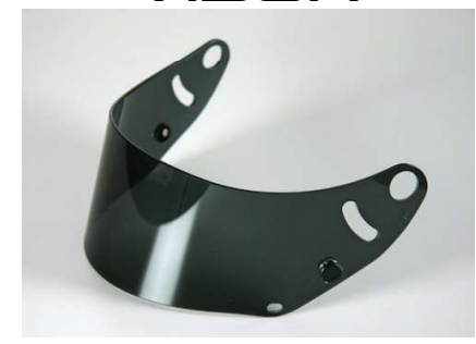
ANTI FOG Visor